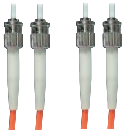
ST to ST-style Duplex MM