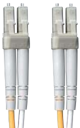
LC Duplex to LC Duplex MM