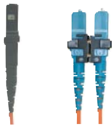
MT-RJ Duplex to SC Duplex MM