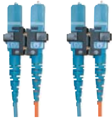
SC Duplex to SC Duplex MM