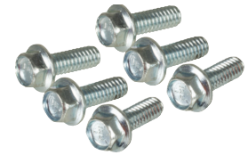
MULTI-BAY HARDWARE KIT