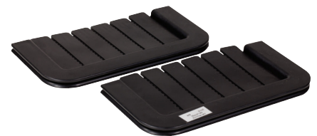
TOP PANEL GROMMET