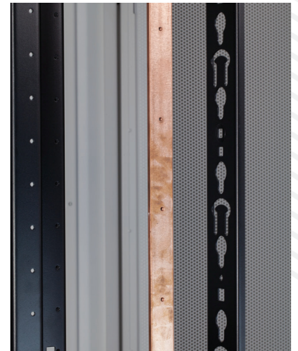
NON-ISOLATED GROUNDING BAR